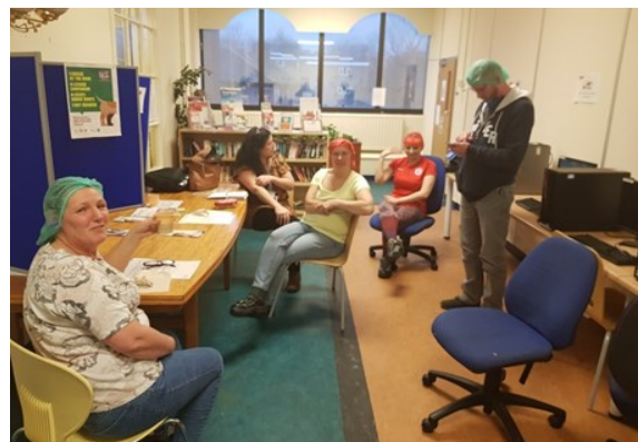
Learners from the Functional Skills English Class taking Time out from their class. Pic above.

Currently there is a Functional Skills English class every Tuesday and Friday. The classes run from 13:30 to 15:30, 1 hour is company paid and 1 hour is the learners own time. This 50/50 release has been agreed with the Company and the BFAWU. There have been many courses run in the learning centre, from Mental Health Awareness to the Functional Skills English classes. Assessments, exams and celebration days have also taken place in the learning centre.